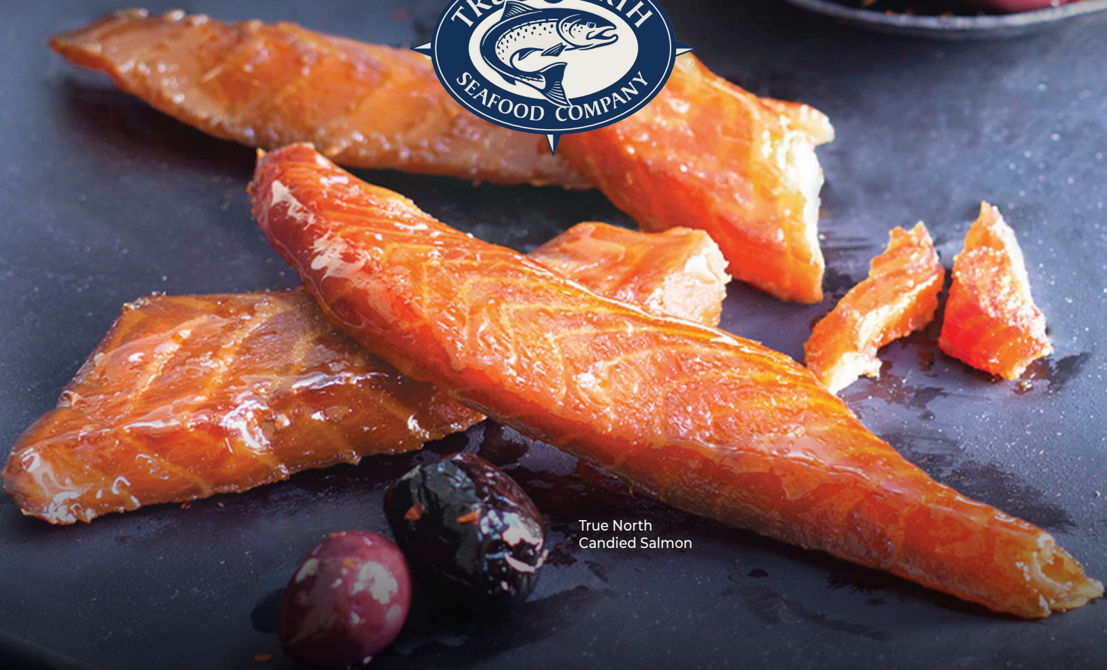
True North Candied Salmon